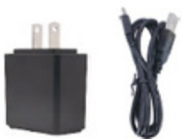
PD Fast charge adapter